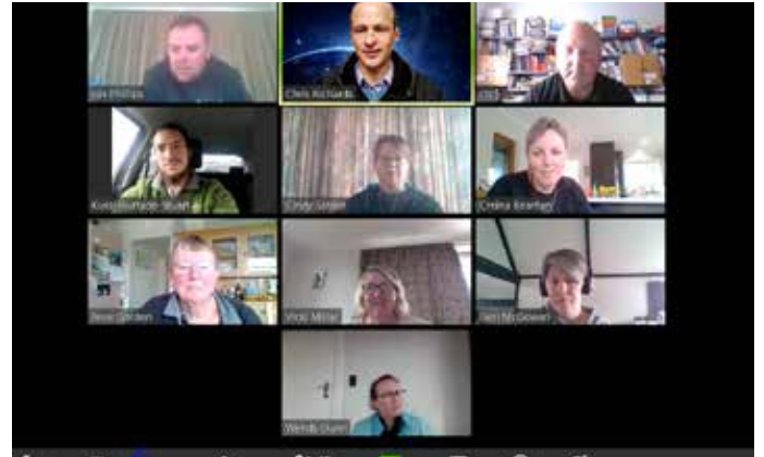
Science staff having a Zoom Departmental meeting during the lock-down.