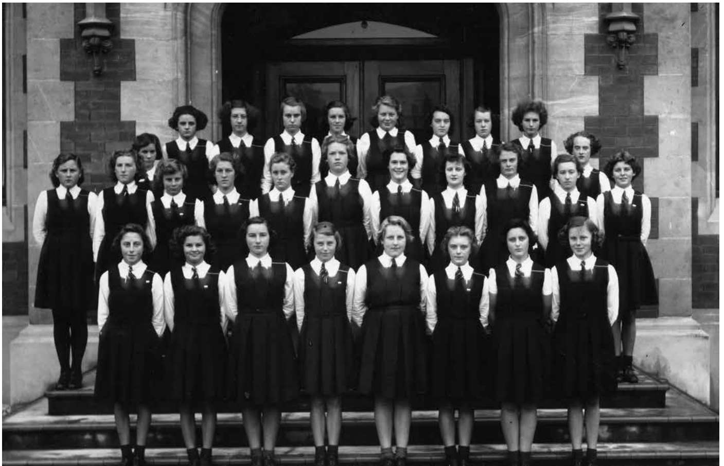
Form IVO, 1947