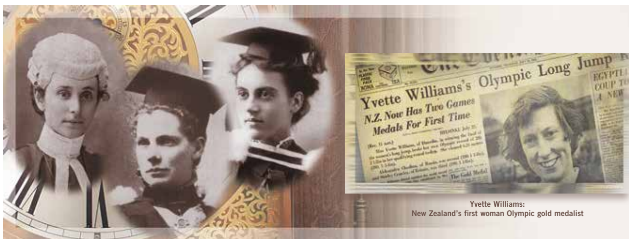
Ethel Benjamin: New Zealand's first woman lawyer

An unequalled tradition of success in educating girls has seen Otago Girls' graduates become New Zealand's first women doctors, lawyers and judges; win Olympic and Commonwealth games medals; and gain international recognition in cuisine, music and the arts.